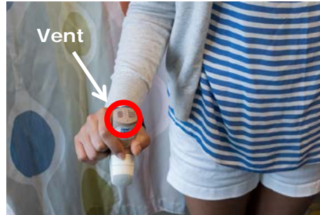
2 Hold the inhaler upright. The cap should be at the bottom. Do not cover the vent at the top.