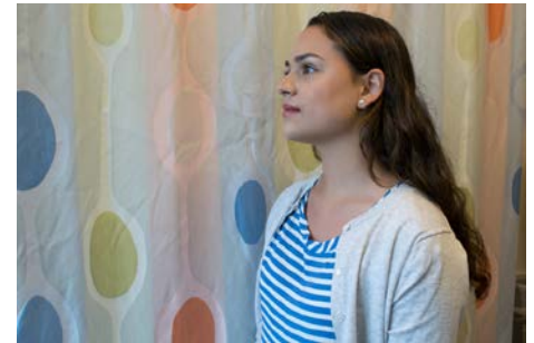
6 Take the inhaler out of your mouth and hold your breath for 10 seconds.