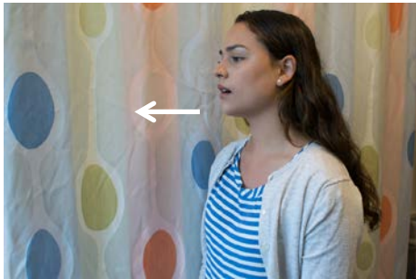
4 Turn your head away from the inhaler and exhale (breathe out) all the way.