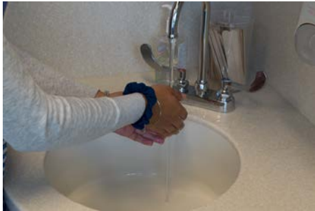
1 Wash your hands.

Your provider has prescribed medication that is given using the QVAR ReditHaler. This medication is given in two strengths: 40 mcg (tan) and 80 mcg (red). Which dose do you have?