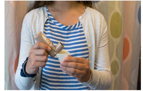
3 Open the cap.