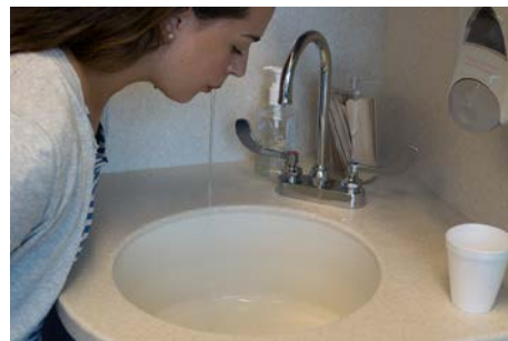
8 Rinse out your mouth with water. Spit.