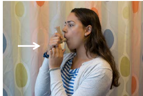
5 Put the inhaler in your mouth and close your lips around the mouthpiece. Take a deep breath in.