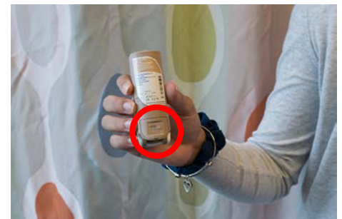
9 Check the back of the inhaler to see how many doses are left. The numbers will turn red when you have 20 doses left. That means it is time to refill your medication.

Note: Clean the mouthpiece with a dry cloth only. Do not use water on this inhaler.