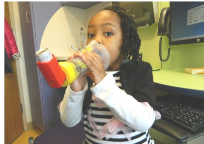
6. Put the face mask on so it forms a tight seal.