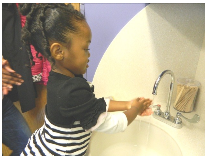
1. Wash hands.

First time using your inhaler? Haven't used your inhaler in awhile? You need to "prime" it! Do this by squirting the inhaler 3 to 4 times in the air — away from your face — until you see the medicine come out.