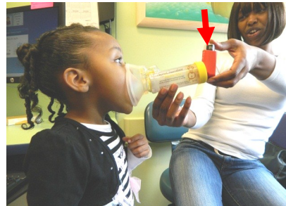
7. Press down on inhaler to put 1 puff of medicine in chamber.