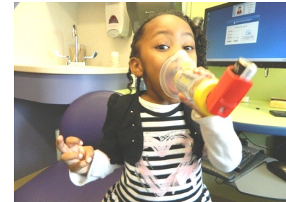
8. Breathe in and out 5 to 6 times. Use your fingers to count breaths.

NOTE: If your dose is more than one puff, shake inhaler and repeat steps 4-8.