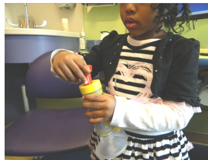
3. Attach inhaler to spacer with face mask.