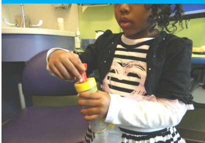
9. Remove inhaler from spacer.

NOTE: If your dose is more than one puff, shake inhaler and repeat steps 4-8.