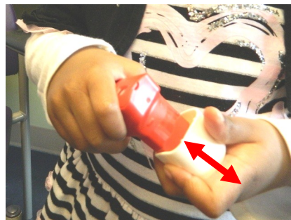
2. Take cap off inhaler.