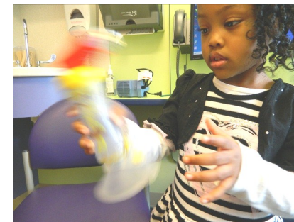
4. Shake inhaler and spacer to mix up medicine.