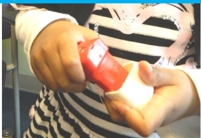
10. Put cap on inhaler.