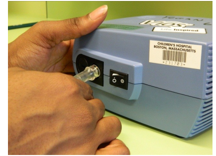
4. Attach other end of tubing to nebulizer machine.