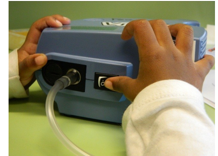
8. Turn on the nebulizer machine.