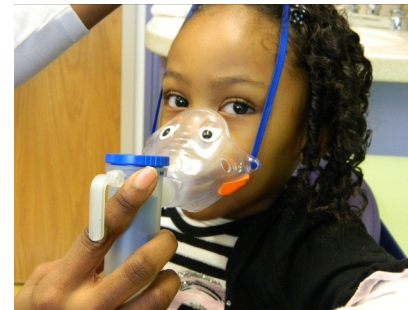
7. Put on face mask.