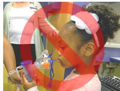
DO NOT hold mask away from face while breathing in medicine.