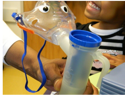
2. Put face mask on the nebulizer container.