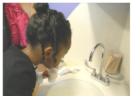
11. Spit out water.