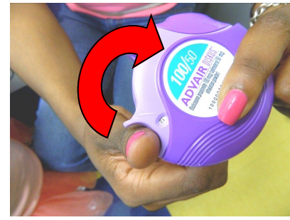
7. Put thumb in grip and move back toward you to close.