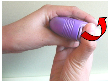
2. Put thumb in grip and push away from you.