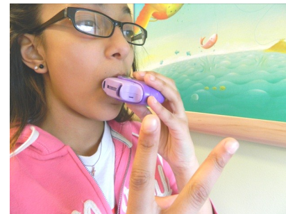
6. Try to hold breath for 10 seconds. Use your fingers to count the seconds!