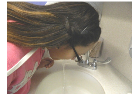
8. Rinse mouth with water. Spit.