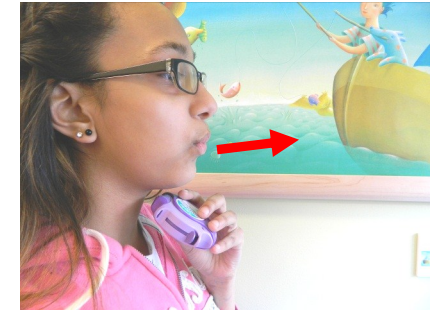
4. Hold inhaler under chin. Breathe out.