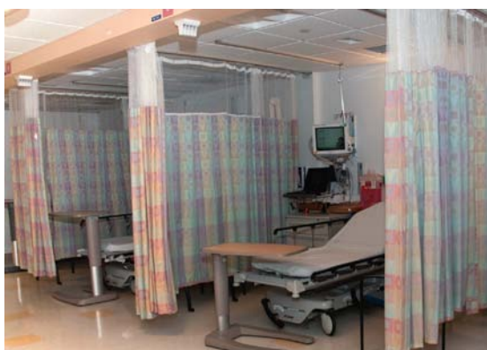
Pre-Op holding area