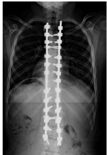
after posterior spinal fusion