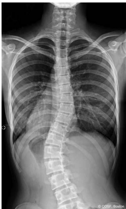
before anterior spinal fusion

Sometimes, the doctor wants to release the tight ligaments, and then slowly stretch the spine for several weeks in the hospital, to make the spinal curves as small as possible before the final fusion. This means the doctor will do the releases, but he will not put the rods or bone chips onto the spine to fuse. The doctor will then admit your child to the hospital for a period of 2-6 weeks for halo traction. Your child will then return to the operating room for a posterior spinal fusion ( see page 7 ).