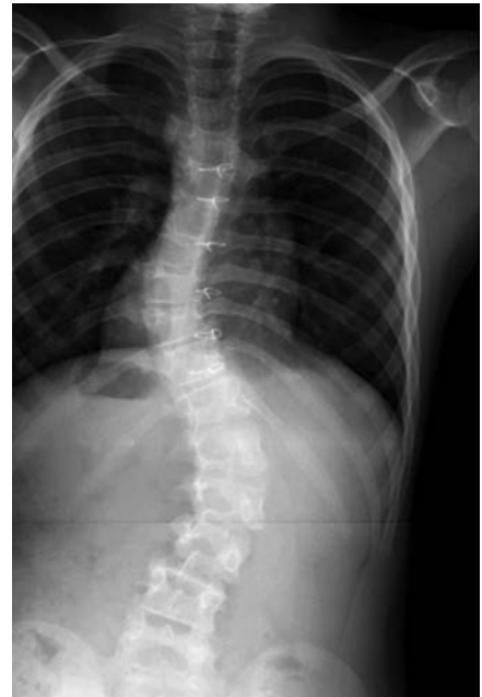
before posterior spinal fusion

Once your child's vital signs are stabilized and he/she can maintain oxygen status without mechanical support, your child will be transitioned to the general floor. From here, your child will have many goals to reach to be discharged. If your child walks at home, physical therapy and nursing will work on exercises and walking to help your child return to baseline. Your child's nutrition will be closely monitored.