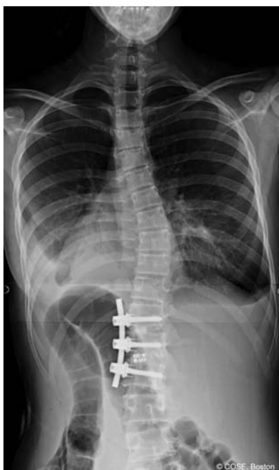
after anterior spinal fusion