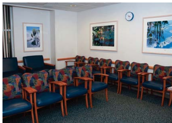
family waiting area