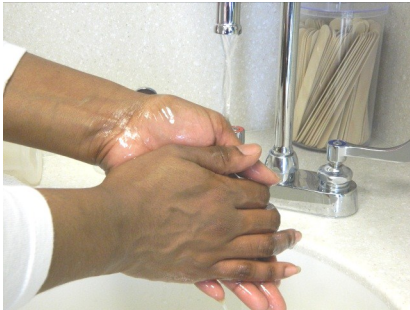
1. Wash hands.

A nebulizer uses a machine that makes a mist of medicine to breathe in through a mouthpiece or face mask. Your child's doctor or nurse will tell you how much medicine to put into the nebulizer. Follow the steps below on how to use a nebulizer with a mouthpiece.