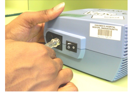
4. Attach other end of tubing to nebulizer machine.