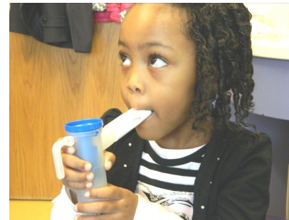
7. Put lips on mouthpiece and breathe normally.