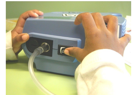
8. Turn on the nebulizer machine.