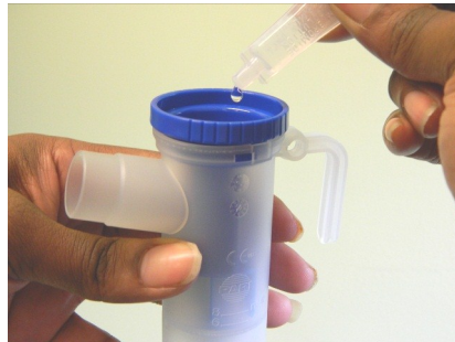
6. Pour medicine into nebulizer container.