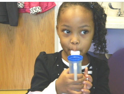
9. Take slow, deep breaths until most of medicine is gone.