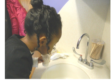
11. Spit out water.