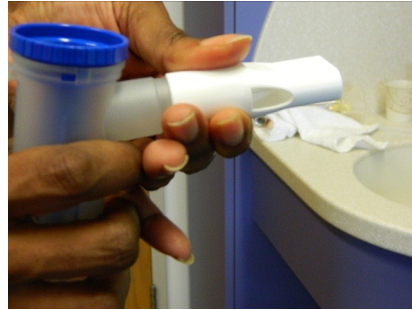
2. Put mouthpiece on the nebulizer container.