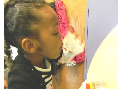
10. Rinse mouth with water.