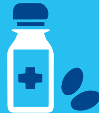
Pharmacy Card and Prescription Bottles