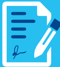
Guardianship Decree (if applicable)