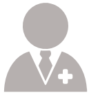
Role of PCP

In adult hospitals , it is much more common for each specialist to work individually.