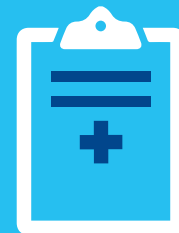
Portable Medical Summary