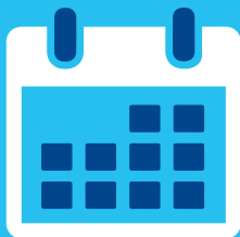
Phone/Calendar for Schedules