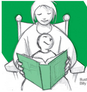
Illustration by Billy Nuñez, age 16