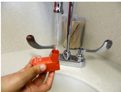
5. Turn the plastic inhaler cover upside down and run that end under warm water for 30 seconds.