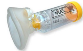
Spacer with face mask