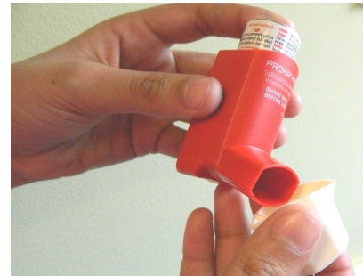
3. Take the cap off of the inhaler.