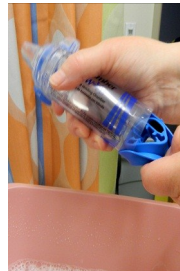
Spacer with mouthpiece