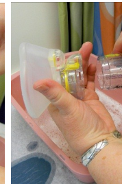
Spacer with face mask

3. Twist off the front part of the spacer.