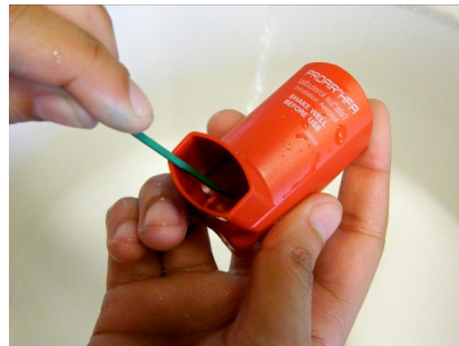
6. If needed, use a toothpick to remove hardened medicine from the small hole inside the plastic inhaler cover.