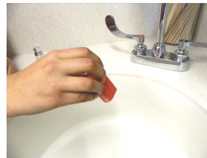
7. Shake off any water on the inhaler cover.