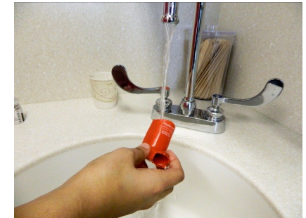
4. Hold one end of the plastic inhaler cover under warm water for 30 seconds.