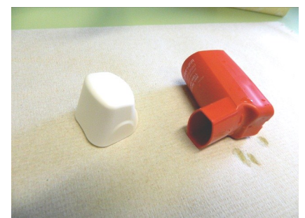
8. Place cleaned parts of inhaler on paper towel and let air dry.