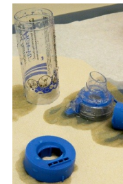
Spacer with mouthpiece