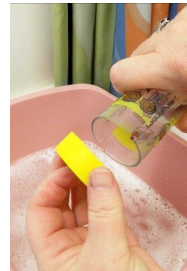
Spacer with face mask

2. Pull off flexible back of spacer where the inhaler goes.