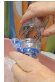
Spacer with mouthpiece

2. Pull off flexible back of spacer where the inhaler goes.