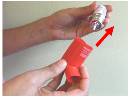
2. Take the canister out of the plastic inhaler cover.