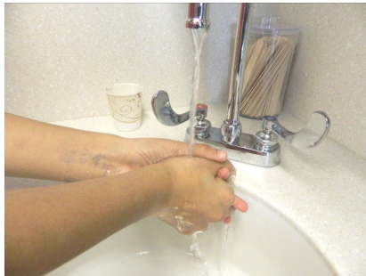
1. Wash hands.

IMPORTANT NOTE: Do not clean the metal canister or get it wet.