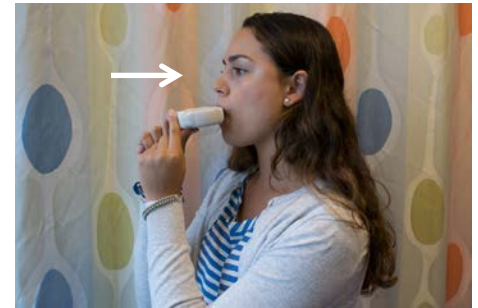
6 Put your lips around the mouthpiece and take a deep breath in.