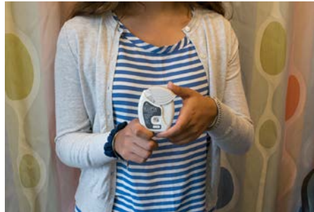
2 Put your thumb on the grooves of the inhaler cover.