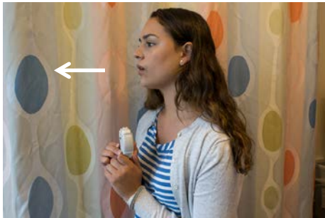
4 Hold the inhaler under your chin and exhale (breathe out).