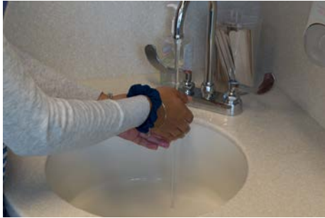
1 Wash your hands.

Note: Clean the mouthpiece with a dry cloth only. Do not use water on this inhaler.