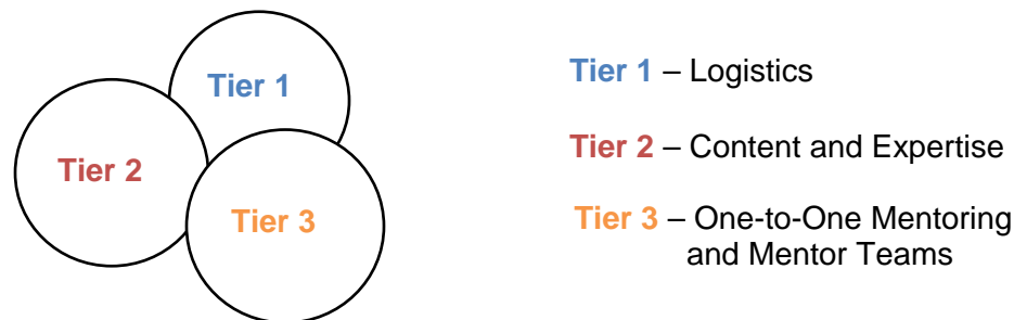
Figure 1. The Three Tiers of Resources for Mentoring

Boston Children's Hospital Office of Faculty Development (OFD) and the Department/Division and Program Chairs are committed to high quality mentoring and access to opportunities for career advising and faculty development. 1 The BCH framework includes resources, one-to-one mentoring, and the creation of mentor teams and "Developmental Networks." 2 The three tiers of OFD resources include logistical information with print and electronic media such as the OFD newsletter Perspectives and website ( www.childrenshospital.org/research/ofd ) with links to the HMS materials in Tier 1 , skills building courses and research fellowships in Tier 2 , and committed personal and professional relationships in Tier 3 .