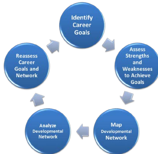
Figure 2. Identifying Career Goals and Mapping Developmental Networks