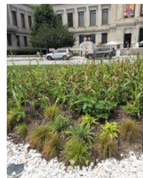
What a summer walk revealed: an Indigenous corn garden emerging at the MFA

What can make your Monday magical? Please email any suggestions to ofd@childrens.harvard and we would be happy to publish them. And don’t forget that these tips might work for any problematic weekday.