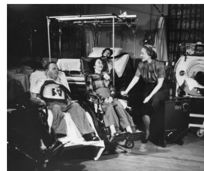
Actress Helen Hayes visiting with patients in the Mary MacArthur Respirator Unit, 1950