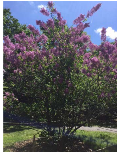
An Arnold Arboretum lilac at peak bloom

Friday, June 21: Summer Solstice Celebration Night at the Harvard Museums of Science and Culture; to mark the solstice, free admission to 4 museums, flower crowns, and astronomy lessons are offered from 5 to 9pm; see https://hmnh.harvard.edu/event/summer-solstice