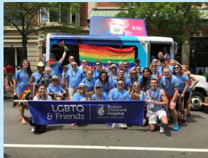
BCH staff and families celebrate at the 6/9 Pride Parade

Archived Link for 2018 LGBTQ & Friends Celebration: http://bit.ly/2ma5nOv